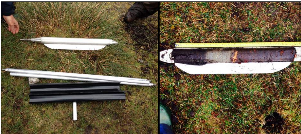
Figure 1: Russian Peat Corer. (a) The corer in an 'open' position with detachable extension rods and sections of plastic guttering for transporting samples, (b) A sample collected with the chamber now in a 'closed' position.

Russian corers can be used in both unsaturated and semi-saturated environments, however overly saturated material is difficult to sample as the core is not retained in its own sample tube and instead must be transferred from the fin plate to a suitable container for transportation. Russian corers have been extensively used in terrestrial studies in peat bog, marshland and coastal environments (e.g. Dawson et al. 2004; Jordan et al. 2010; Long et al. 2011; Schofield and Edwards 2011; Long et al. 2012). The base 15-20cm of sedimentary basins can be difficult to sample due to the 'nosecone' of the Russian corer. Also, the system can be heavy making transport to remote sites difficult.