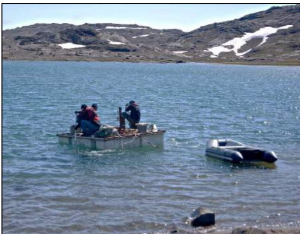
Figure 5: Coring from an isopore block raft platform, SE Greenland.

When coring in lacustrine or shallow marine environments a raft or boat is often necessary, for which several designs are available. Many raft designs are also modular, meaning that they can be transported with relative ease to remote locations and assembled on site. Some rafts make use of foam blocks for buoyancy (e.g. Figure 5), while others are simply metal, wooden or plastic platforms strapped to a Zodiac-style inflatable boat. It is important to ensure that the chosen raft has sufficient buoyancy for the extraction of deep sediment cores, as the core can only be extruded when the force of the raft buoyancy exceeds that of the friction and vacuum-suction acting on the coring chamber. Many rafts are mounted with a tripod and winch system which can make the extraction of heavy samples easier.