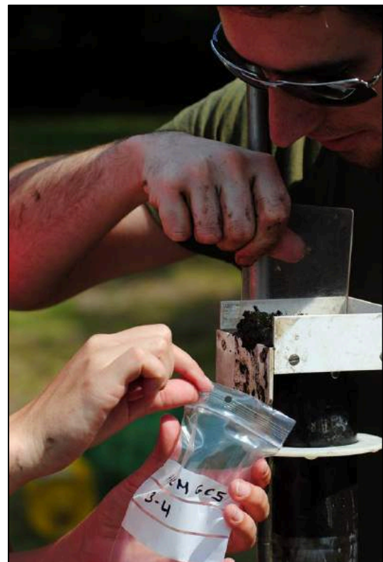
Figure 4: Subsampling of a surface core at Hämelsee, Germany, using an extruder device.

Other surface sediment corers include designs that maintain the sample in a coring chamber through the messenger triggered deployment of a suction cup at the head of the device. This creates a vacuum, capable of holding fine grained, consolidated sediments. The waterlogged sediments can then be subsampled for transport using an extruder device (Figure 4). Such systems suffer similar problems in terms of the bow wave induced washout of surface fines, however they tend to be lightweight, modular and therefore more suitable for remote field sites.