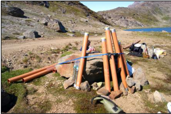
Figure 6: Storage of cores in the field can be difficult. Here, cores are strapped to a boulder in an upright position in order to allow the sample to settle.

cores for transportation, however ice crystal growth can potentially disrupt fragile sedimentary features. For cores collected using a 'Russian' peat corer, the sample can be transferred into half sections of PVC guttering and secured with appropriate packing material (paper or plastic wrap if the samples are to be radiocarbon dated) to soak up excess water before being wrapped in plastic wrap for transportation.